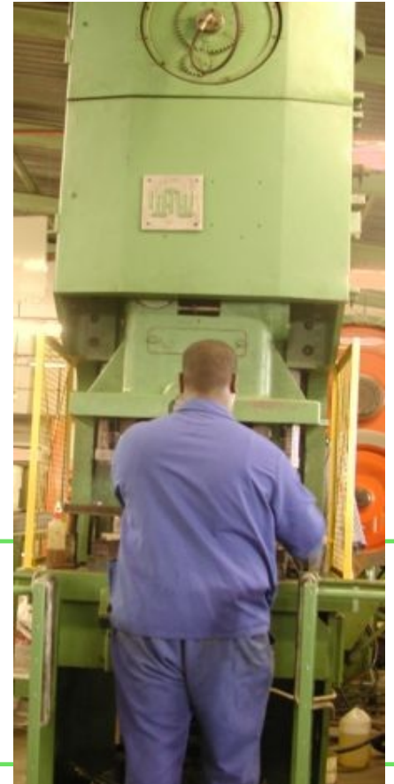
THE 160 TON PRESS To cope with the export demand for seat belt components.

A new export contract was awarded to Webroy for seat belt components, following which a 160 ton press and a new Digibend were commissioned in September. This added capacity has led to confirmation of an additional export contract for three more components destined for Germany.