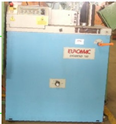
THE EUROMAC DIGIBEND CNC controlled bender for heavy wires and small pressings.