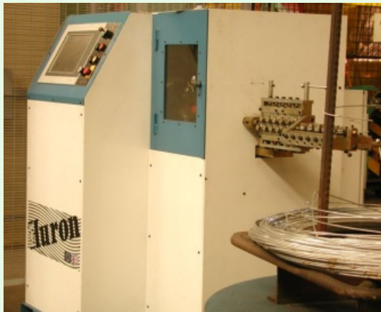
PAVE HURON imported from England as the first one in the country, and third CNC wire former on Webroy's factory